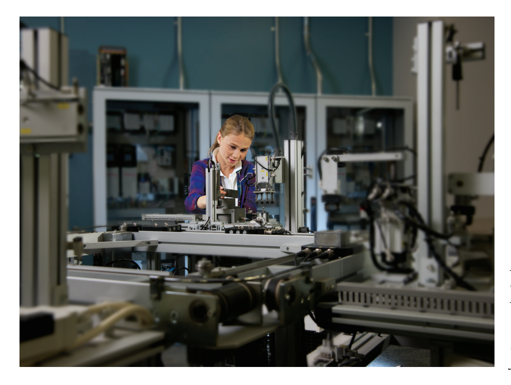
Most High Schools and Middle Schools in Rhode Island do not have adequate science facilities.

The Schoolhouse Report identified multiple building deficiencies in every school district and found that most districts have schools with significant condition needs. The Task Force was careful to ensure that the strategies outlined below were actionable and equitable, and that all school districts could benefit from the recommendations.